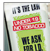
The We-Expect-ID Age Verification program is being implemented by most of the major convenience store chains and many independent stores.

Make sure to become a member of your regional association to benefit from the We Expect I.D. program. It's not only about age verification, but also about workplace safety training, customer service training, hazardous materials training and much more. Visit the Canadian Convenience Stores Association's website for more details.