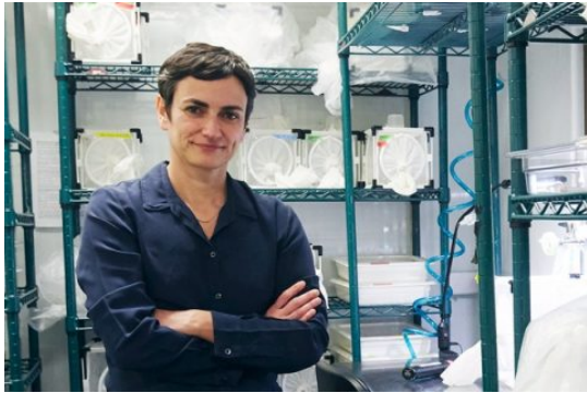
Sex, drugs & mosquitoes