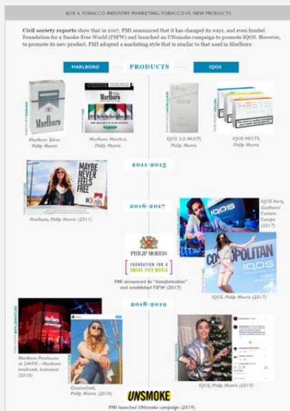
Image Source: Box 6 (Tobacco industry marketing: Tobacco vs. new products). In: Global Center for Good Governance in Tobacco Control (GGTC). 26 May 2020. Tobacco industry: Manipulating the youth into a lifelong addiction.

More women than men smoke "light" cigarettes (63% versus 46%), often in the mistaken belief that "light" means "safer". 100 In fact, "light" smokers often engage in compensatory smoking, inhaling more deeply and more frequently to absorb the desired amount of nicotine. 101 Women's penchant for "safer" products suggest that it is a strong target market for novel products that tobacco companies market as "safer" such as heated tobacco products or e-cigarettes. The gender-specific marketing for cigarette brands like Virginia Slims in the 1990s are replicated in the marketing for the new products IQOS, Blu, Glo or Vype.