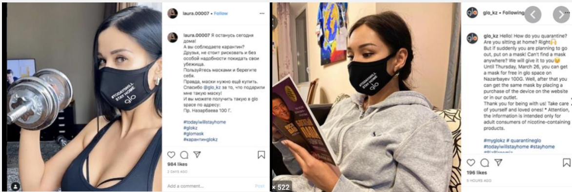
Source: Hickman A. 15 May 2020. "Big Tobacco" using COVID-19 messaging and influencers to market products. PR Week.

COVID-19 also provided a unique marketing opportunity for tobacco companies. In 2020, BAT promoted its product glo using women keeping fit and safe (in quarantine) using masks with the e-cigarette brand name. BAT reportedly invested GBP £1 Billion to promote its new products in digital media including the use of influencers. Notably, the tobacco companies were found to be behind the spread of misinformation about how nicotine protects against COVID-19, 103, 104, 105 confounding the fact that smoking worsens outcomes for those afflicted with COVID-19 and vaping has been found to increase risks for developing COVID-19. 106, 107, 108, 109