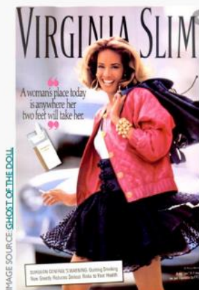
Virginia Slim, 1990, PMI (USA, British Virgin Islands, Brazil, Germany)

Evidence shows how tobacco companies have targeted young women with its cigarette advertisements from the 1970s to 1990s. E-cigarette advertisements now look much like the cigarette advertisement of the past.