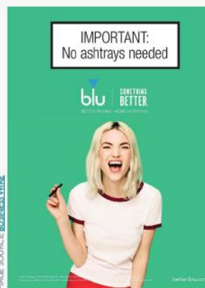
Blu, 2017, Imperial Brand (USA, UK, France and Italy)