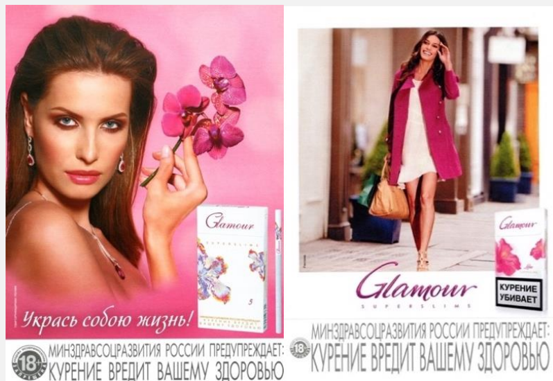
Research into the impact of tobacco advertising. Women's Cigarettes. Glamour.

PMI's marketing of Marlboro to women over the years parallels its more recent marketing of IQOS to women.